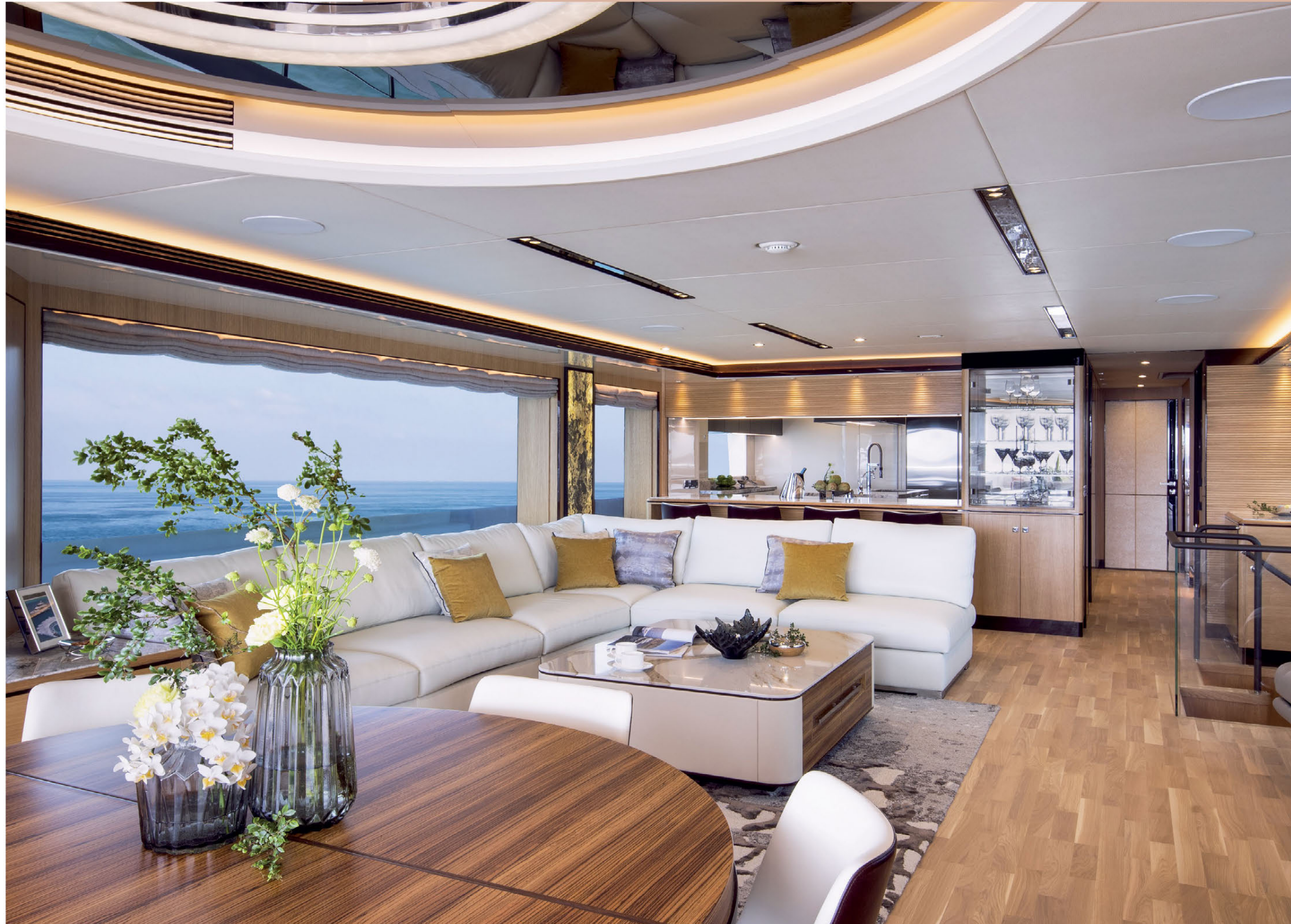
⬆️ Clockwise from top: The 78-foot yacht has lots of volume, large windows, and an airy interior; she accommodates up to 10 guests in five staterooms