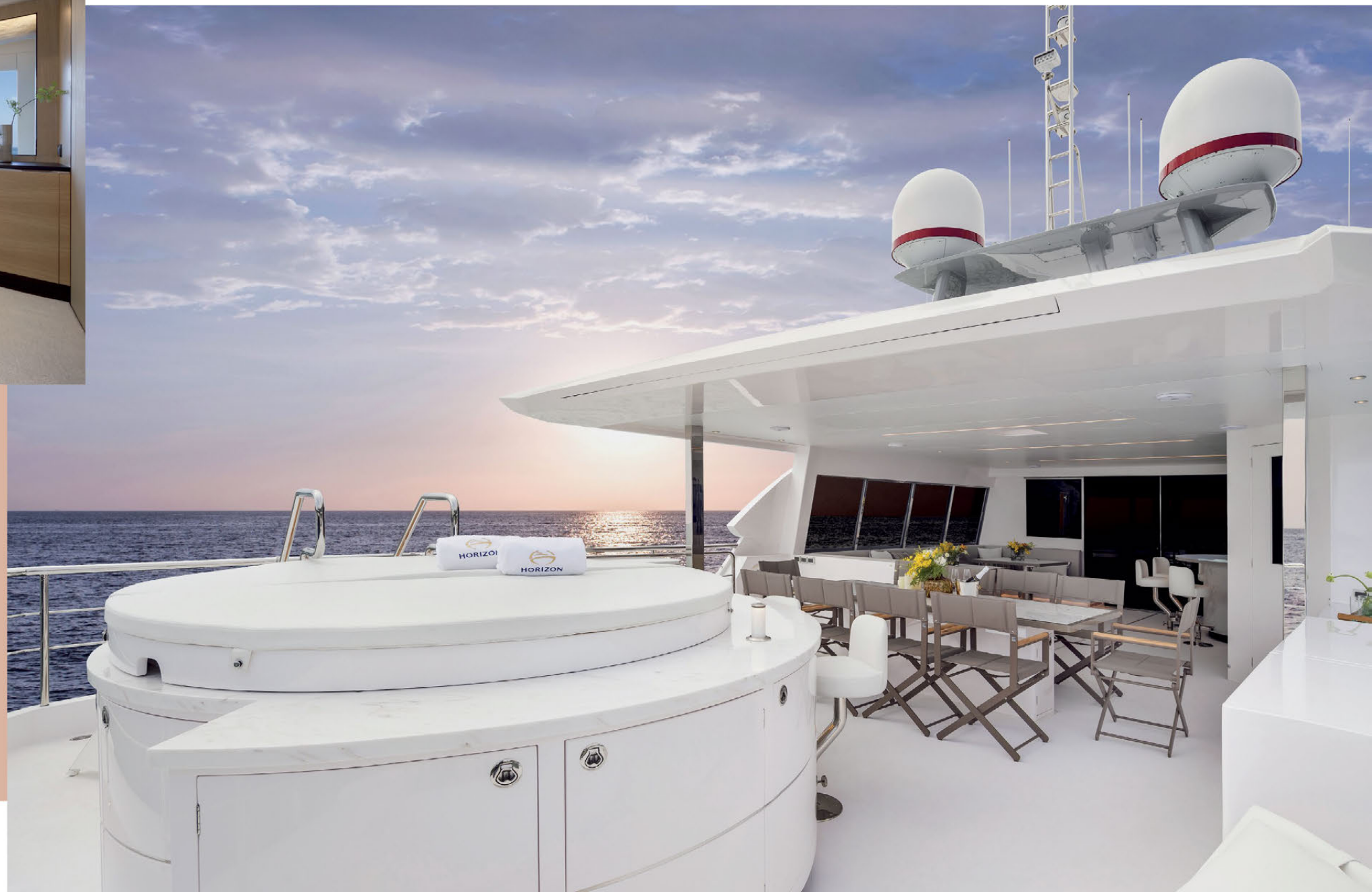
⬅ Clockwise from left: A wave piercing bow combined with a hard chine reduces drag; accommodation includes a full-beam master bedroom; the upper deck functions as an all-in-one leisure area.

Rover. “I was brave to put it on paper, but John was even braver to develop it.” The FD series, which runs from 75 feet to 125 feet, was introduced at the Taiwan Boat Show in 2016.